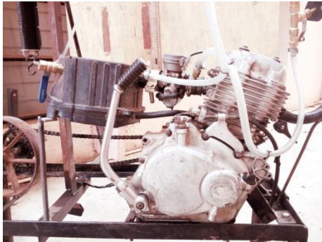
Fig -2: Engine

standard equipment were a novelty in Indian motorcycles of the early 2000s. Other standard features were parking lights and an aircraft-type fuel tank lid.