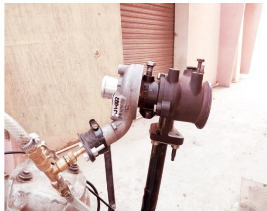
Fig -1: Turbocharger

Turbochargers were originally known as turbosuperchargers when all forced induction devices were classified as superchargers. Nowadays the term "supercharger" is usually applied only to mechanically driven forced induction devices. The key difference between a turbocharger and a conventional supercharger is that a supercharger is mechanically driven by the engine, often through a belt connected to the crankshaft, whereas a turbocharger is powered by a turbine driven by the engine's exhaust gas. Compared to a mechanically driven supercharger, turbochargers tend to be more efficient, but less responsive. Twin charger refers to an engine with both a supercharger and a turbocharger.