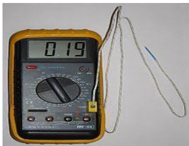
Fig -3: Thermocouple

Thermocouples are widely used in science and industry; applications include temperature measurement for kilns, gas turbine exhaust, diesel engines, and other industrial processes. Thermocouples are also used in homes, offices and businesses as the temperature sensors in thermostats, and also as flame sensors in safety devices for gas-powered major appliances. Commercial thermocouples are inexpensive, interchangeable, are supplied with standard connectors, and can measure a wide range of temperatures. In contrast to most other methods of temperature measurement, thermocouples are self powered and require no external form of excitation. The main limitation with thermocouples is accuracy; system errors of less than one degree Celsius ( ^{\circ}\text{C} ) can be difficult to achieve.