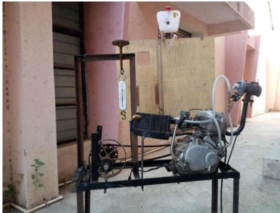
Fig -5: Experimental setup